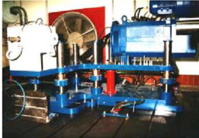
X-Y-Z positioner unit with 7-pillar guide for the mounting of a driving unit