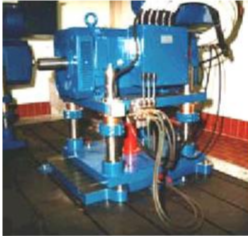
X-Y-Z positioner unit with 4-pillar guide for the mounting of a braking unit

We design and manufacture load rated X-Y-Z Tables for mainly the Automotive Testing Industry. We design and build tables from small to large to cover the whole range of driveline applications. Please e-mail us for a free price quote or call 952 942-6104.