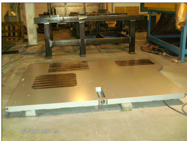
6 Custom Steel base plates for an X-Y positioning system manufactured for Porsche, Germany